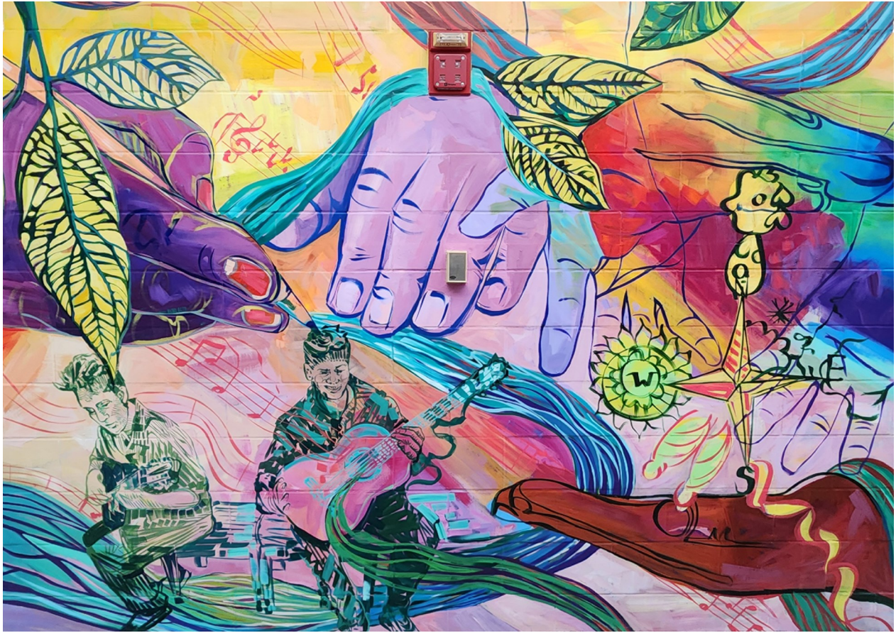
Mural: Anoka-Ramsey Business and Nursing Bulge Hallway